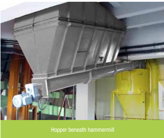
Hopper beneath hammermill