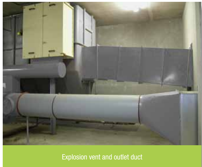
Explosion vent and outlet duct