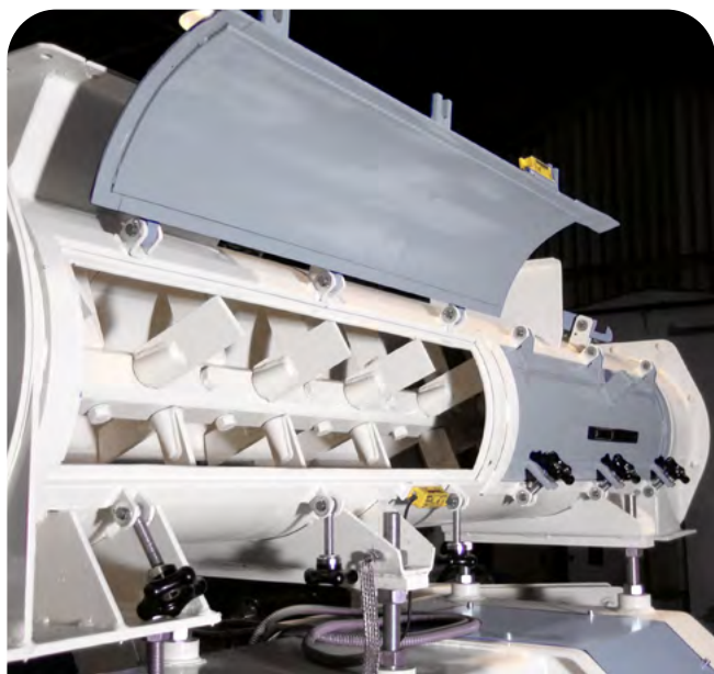
Mixer Conditioner PEP

It is by mixing steam and meal in the right proportions that we obtain the best output from the press and the best quality pellets.