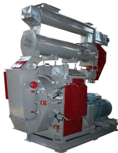
Feeding screw with adjustable speed + mixer conditioner + pellet mill