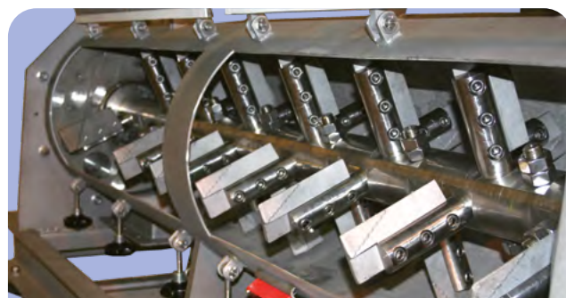
Inside the mixer

A pneumatic bleed at the end of batch to stop instantaneously the liquids flows must be provided.