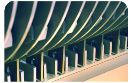
Hard steel Hammers and counter-hammers