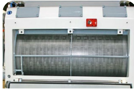
Grinding chamber completely occupied by screens